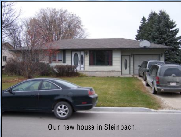
Our new house in Steinbach.