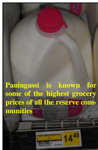
Pauingassi is known for some of the highest grocery prices of all the reserve communities

As we continue to bring in people to work in these communities, it is our hope and prayer that the workers will be a light of Christ's love and hope in a world of pain. It is also our goal that as they do the work that God has called them to do, we will also be a light and encouragement to not only the people of the northern communities, but also to our passengers and the people we rub shoulders with at the various airports we visit. Please join us in praying for these things.